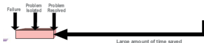
With NAI On-Demand BSM Solution